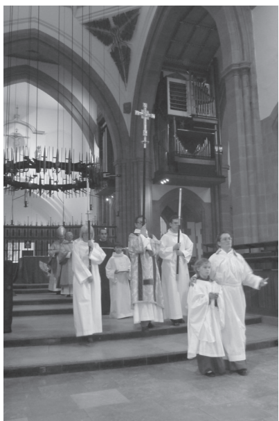
The Bishop's Procession