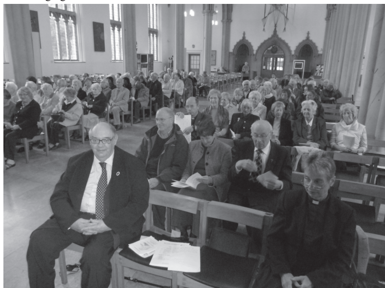
The congregation of Guild members